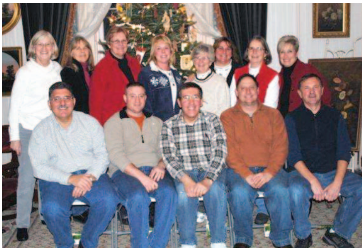
Historical Society Board of Trustees and Trimmers of the Christmas Tree