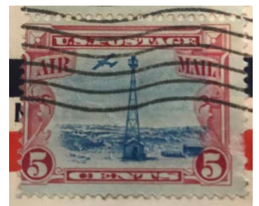
Photo of an Airmail Stamp.