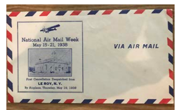
A canceled 1938 National Air Mail Week envelope from LeRoy.