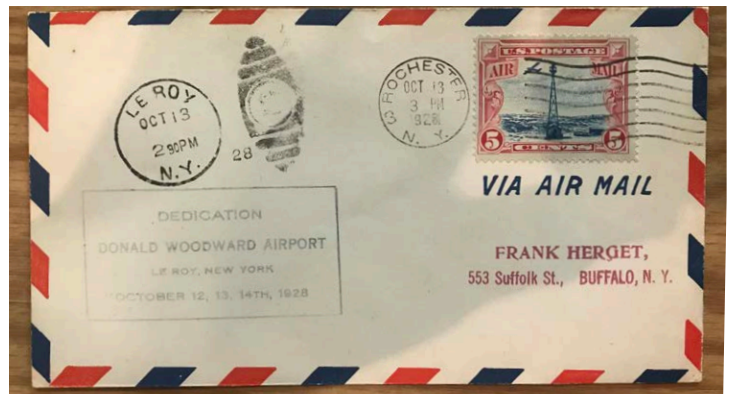
The envelope was first canceled in LeRoy at 2:30 pm on October 13, 1928. It was canceled again in Rochester at 3 pm and flown to Buffalo where it was stamped at 6pm.

Ten years later, in 1938, the U.S. post office declared "National Air Mail Week" from