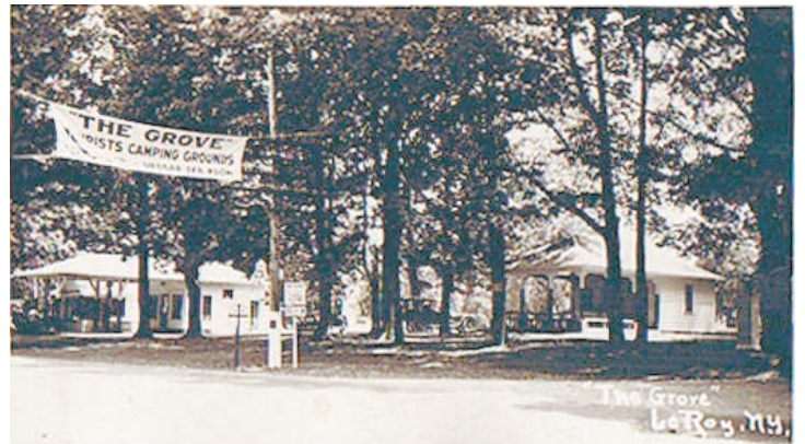
This is the Grove Tourist Camping Ground.

attached to a gas station or a small restaurant. Soon the Grove became a motor hotel (eventually shortened to motel). Unlike hotels that were usually located near the railroad station in a town or city, (such as the old Hotel LeRoy which was located on Lake Street across from the BP&R station) the motor hotel was located near a highway and had an area for parked cars.